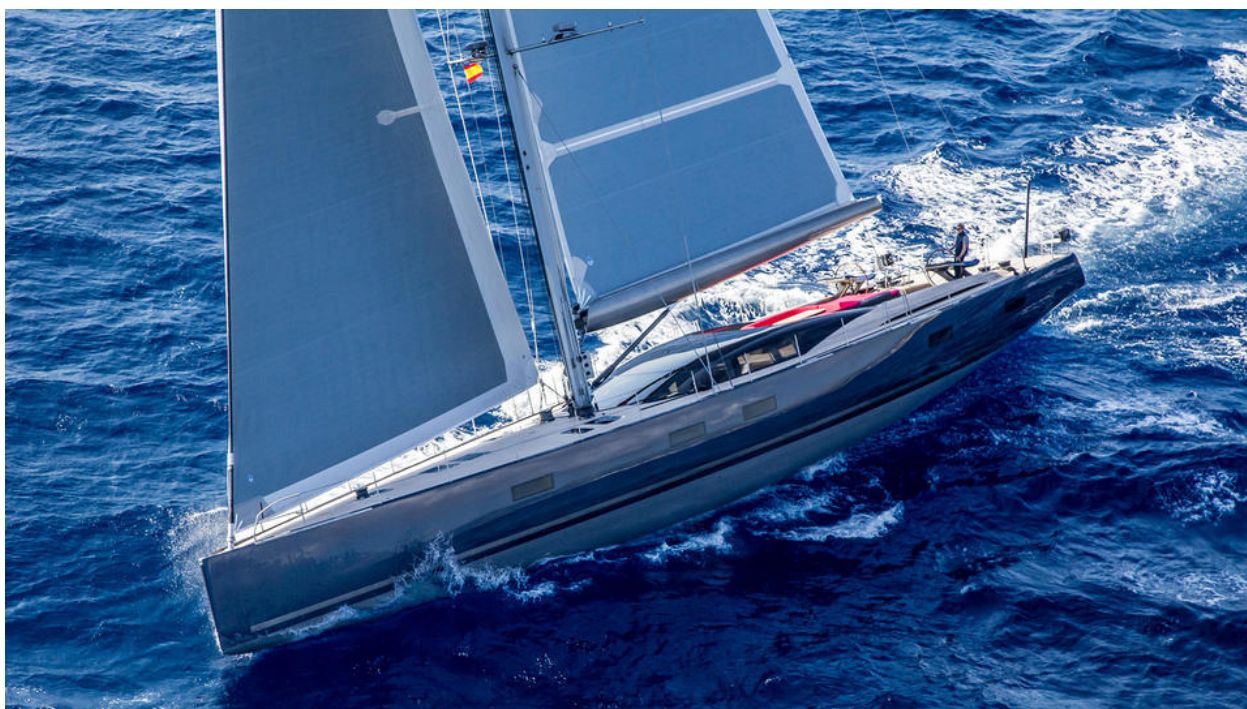
Missy has been pictured cruising in the bay of Palma.